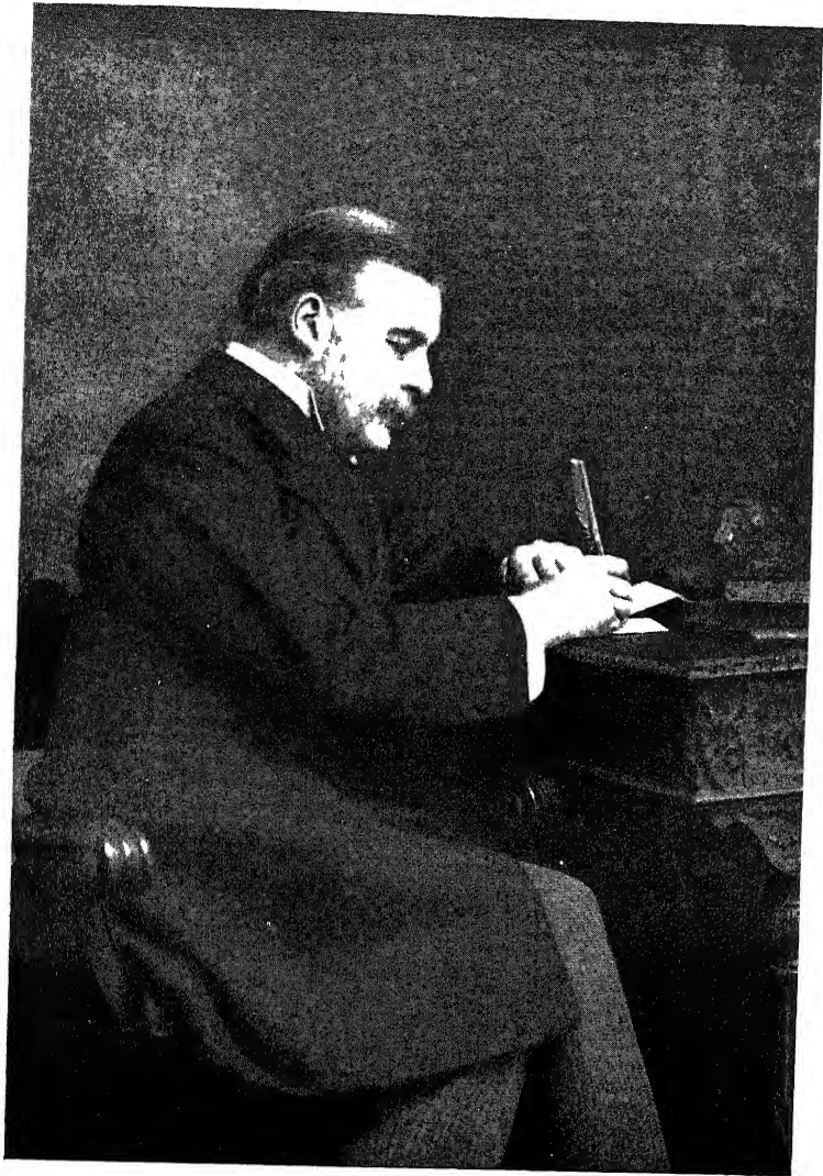
THE LATE SIR ARTHUR SULLIVAN